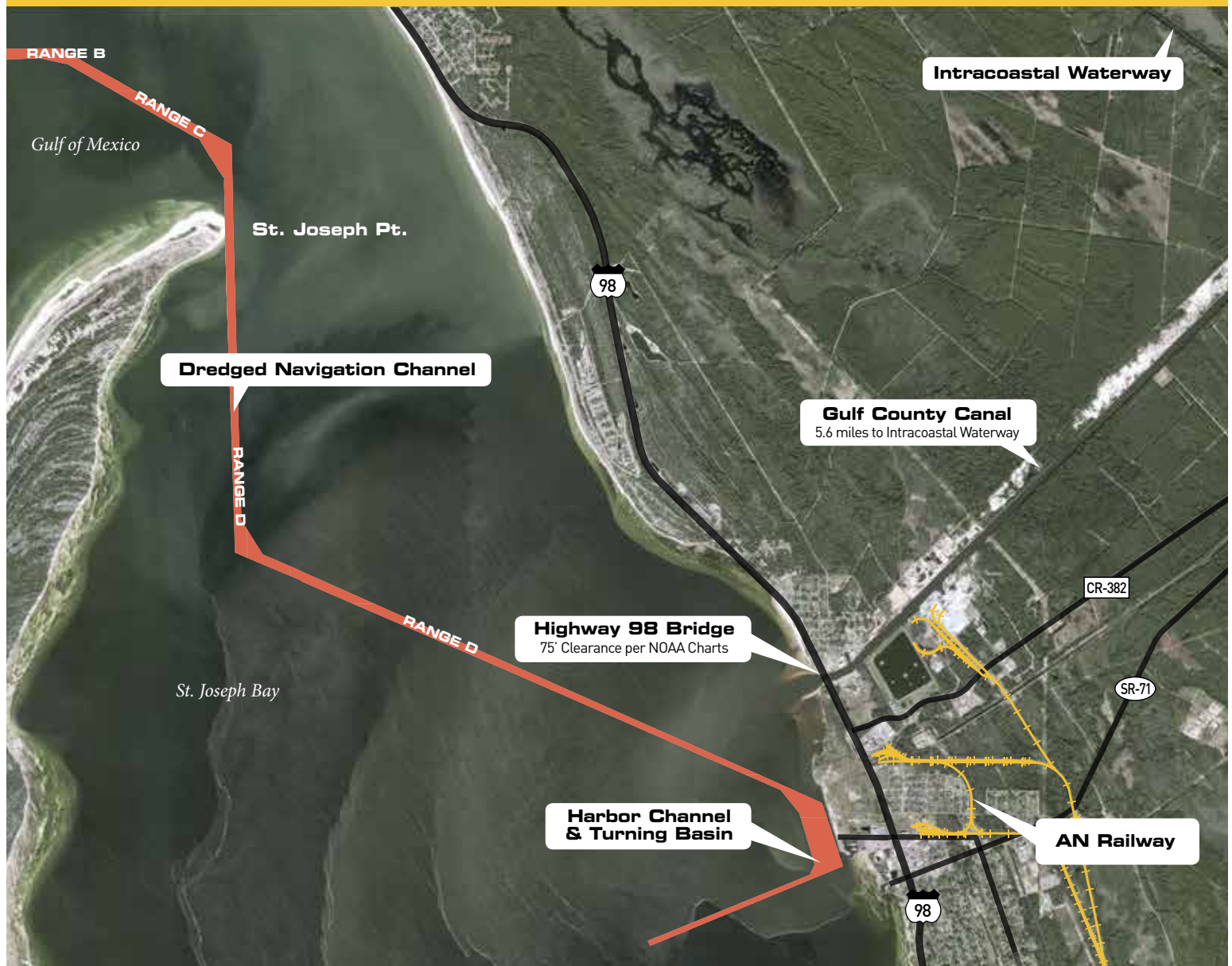
Port St. Joe Harbor Channel Depths - Federally Approved